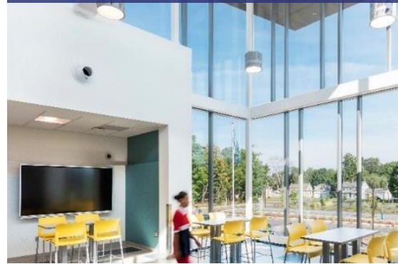
SPATIAL QUALITY + TECHNOLOGY