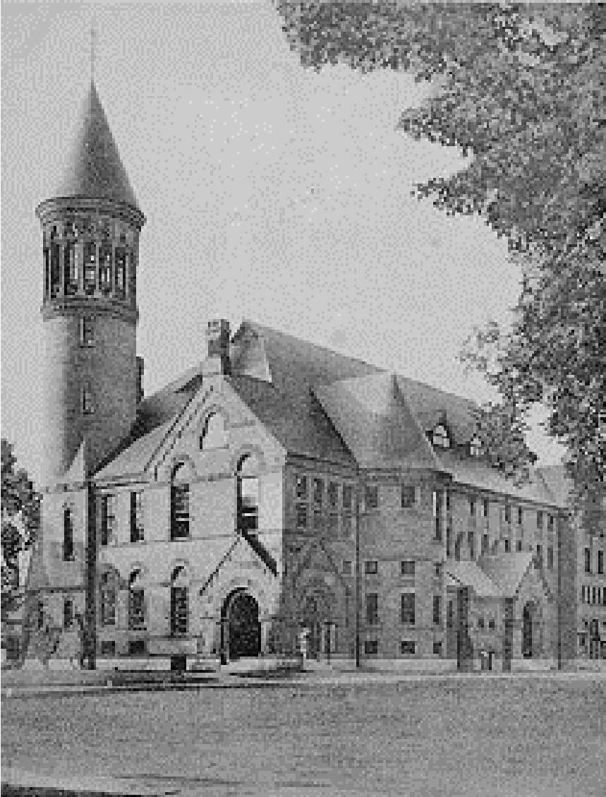
SLATER MEMORIAL, NORWICH, CONN.