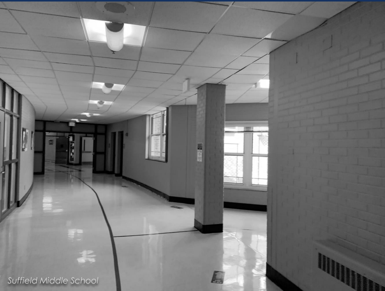
Suffield Middle School