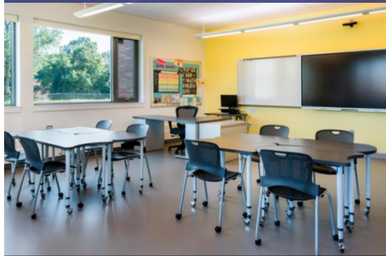
ADAPTABLE & RECONFIGURABLE