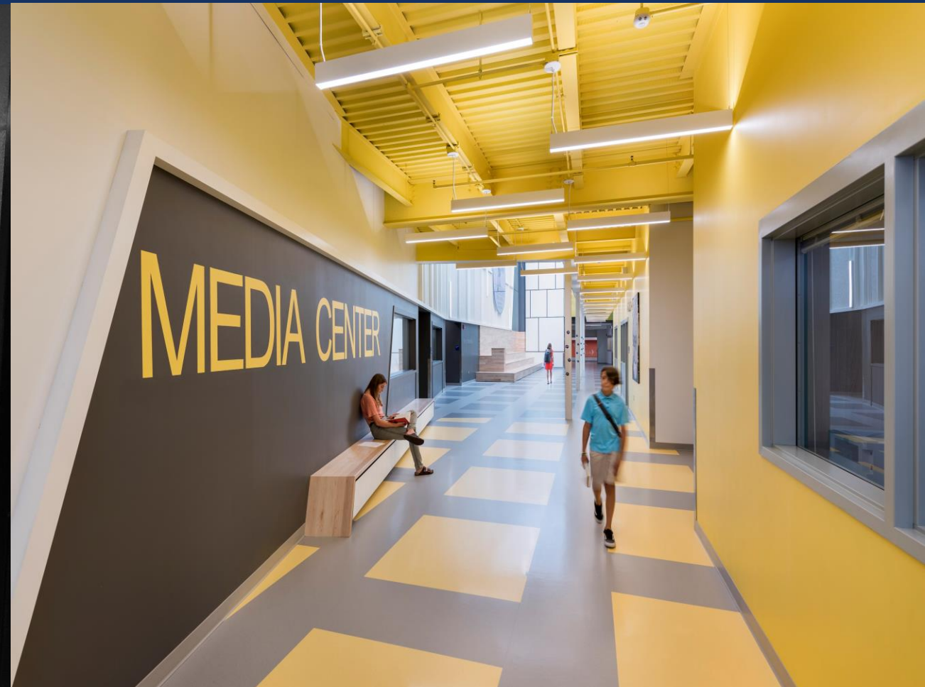
Suffield Middle School