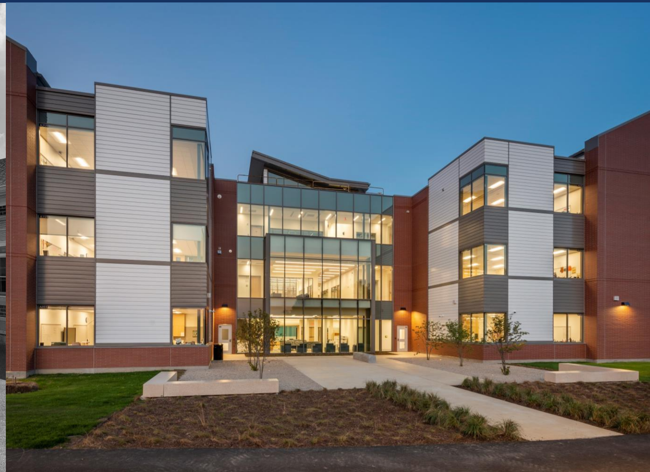
McAlister Intermediate School