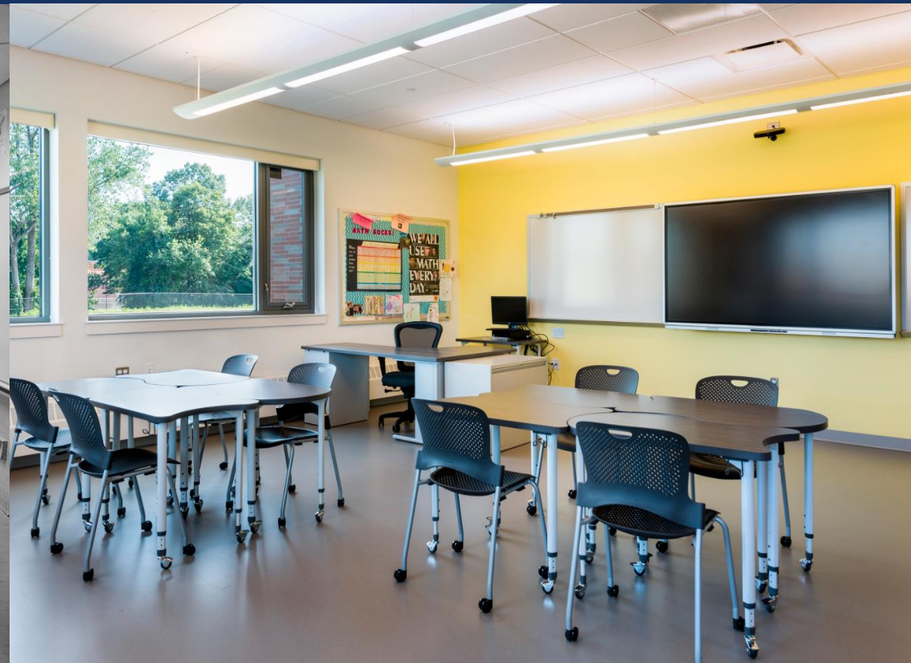
Suffield Middle School