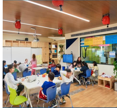
Team Learning and Teaching