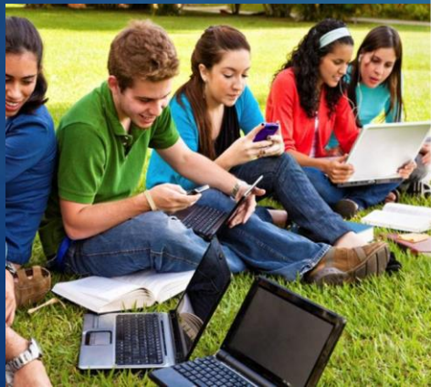
Learning with Mobile Technology