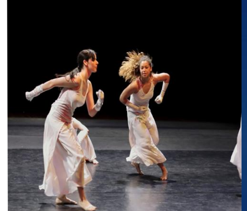
Performance Based Learning