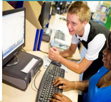
Internet Based Research