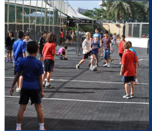
Play and Movement Learning