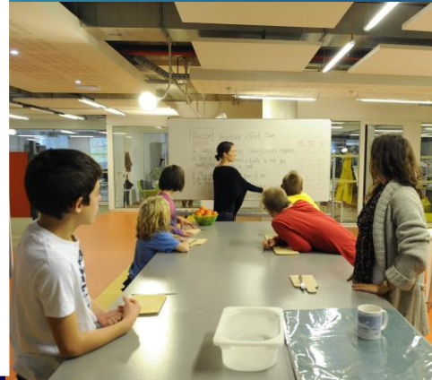
Seminar- Style Instruction