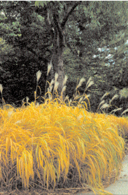
Miscanthus sinensis (Miscanthus grass, also called Maiden grass) variety with leaves turning yellow for fall.

Participants, including landscapers, property managers, and homeowner associations, can compare the actual cost of water used on their property with the calculated budget. Those staying within budget are awarded certification, a proven marketing tool. This new voluntary program is implemented by the Municipal Water District with input from the California Landscape Contractors’ Association, the Orange County Integrated Management Department, the Metropolitan Water District of Southern California, and local nurseries and has the support of 32 retailing water suppliers. The program is already credited with increasing the use of arid-climate shrubs and landscaping to accommodate drip irrigation, and has resulted in cost savings to water customers.