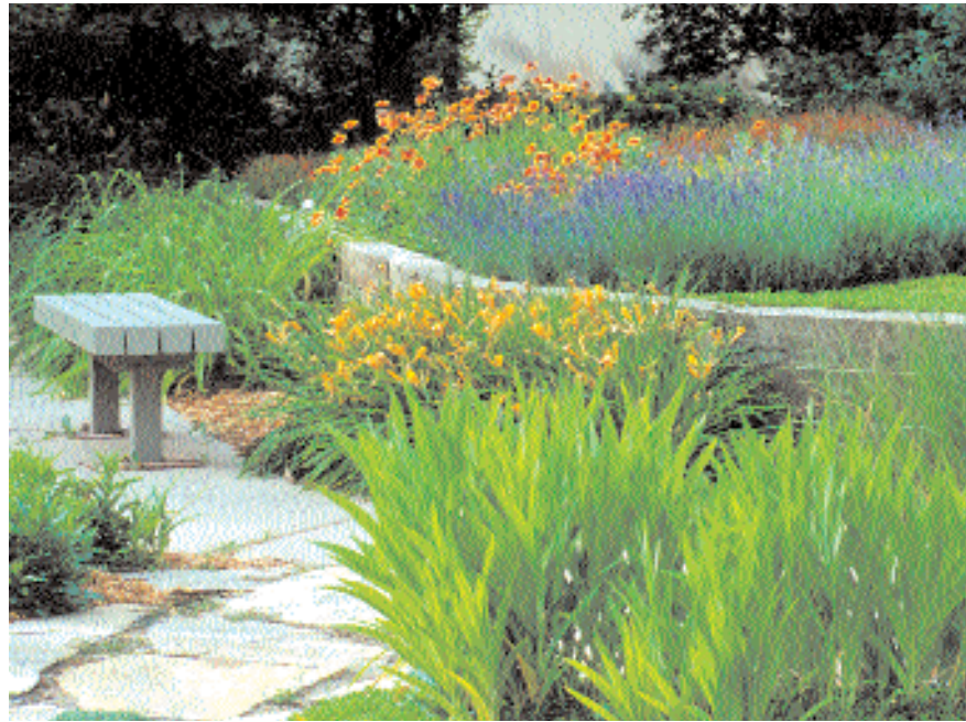
Xeriscape garden at Denver Water

This booklet describes the benefits of water-efficient landscaping. It includes several examples of successful projects and programs, as well as contacts, references, and a short bibliography. For specific information about how to best apply water-efficient landscaping principles to your geographical area, consult with your county