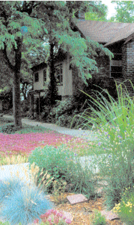
Dragon's Blood Sedum ( Sedum spurium ) under Honeylocust Trees ( Gleditsia triacanthos )

Landscaping that conserves water and protects the environment is not limited to arid landscapes with only rocks and cacti.